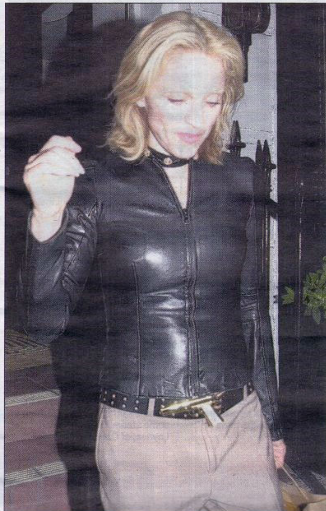
Trigger happy: The star with a gun in her belt