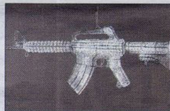
Bright: A chandelier

The ultimate material girl ordered the light for an undisclosed fee not long after she released the 2009 single. The smallest of these huge lights